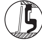
SR type seal